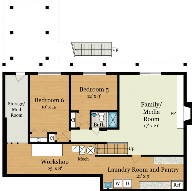
LOWER LEVEL 1,295 SQ FT

Above-Grade: 2,670 SQ FT Below-Grade: 1,295 SQ FT