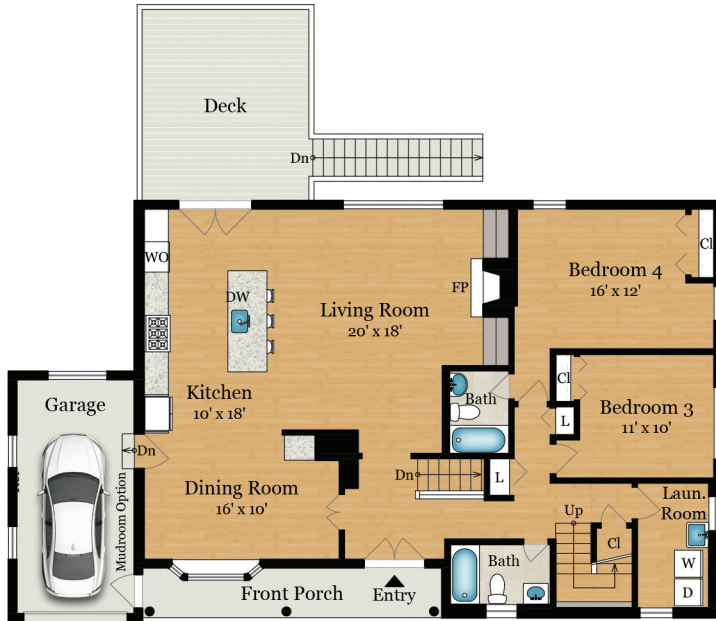
MAIN LEVEL 1,560 SQ FT